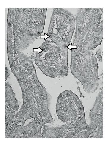
Figure 5. Moderate staining of the epithelial cells (arrows) in the 7-day-old chicks' ileal epithelium. GLUT-5. 200×.