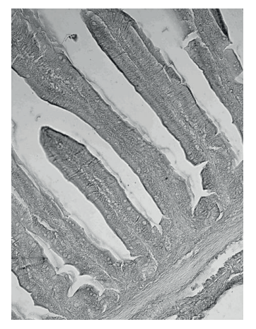
Figure 4. Weak staining for GLUT-2 in epithelial cells of the duodenal villi of 7-day-old ostriches. 200×.

In 7-day-old ostriches, the expression of both antibodies was mostly weak in duodenal but moderate in ileal epithelial cells (Fig. 4–5).