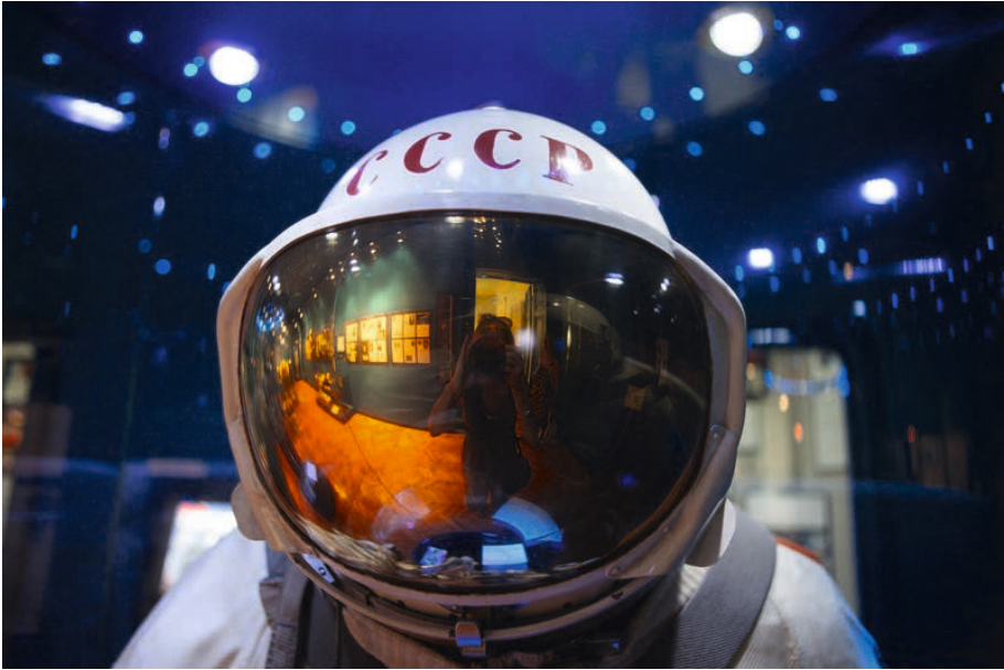
Figure 7. Fragments from the present permanent exhibition: Medicine in space. (Pauls Stradiņš Museum of the History of Medicine).

physiology, microbiology, psychiatry, etc. Thematically selected objects are books, documents, collections of medical instruments or equipment, portraits or genre scenes and even sculptures; they give an idea of a specific branch of medicine, for example, collections of stethoscopes, impact hammers and pleximeters, X-ray medical devices, rehabilitation equipment for recovering the health of patients, and others. The memorial collection of Ilya Mechnikov is exhibited in its own interior where original items are displayed along with samples of period furniture and, in addition, a large tapestry with images of famous microbiologists.