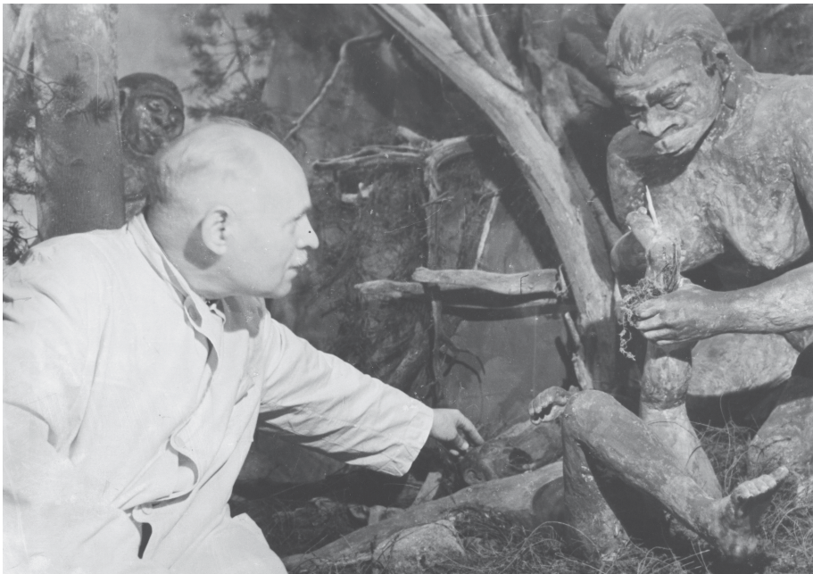
Figure 2. Professor Pauls Stradiņš creating diorama.1957. (Pauls Stradiņš Museum of the History of Medicine).