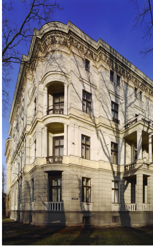
Figure 3. Main building of the Pauls Stradiņš Museum of the History of Medicine in Riga.

The Soviet government nationalised the building, and the Central Committee of the Young Communist League was located in it immediately after World War II. In 1957, the building was handed over to the museum. Within a few years it was adapted to the needs of a public museum, and, since 1961, the permanent exhibition of the Museum has been on show on its three floors as well as on the basement floor. The total area of the museum premises is 2490 m 2 [10]. An enclosed patio garden and the wide fenced green strip along Antonijas Street and Kalpaka Boulevard are adjacent to the museum building. The museum's patio garden is the only garden open to the public on Riga boulevards arcs. (Fig. 3).