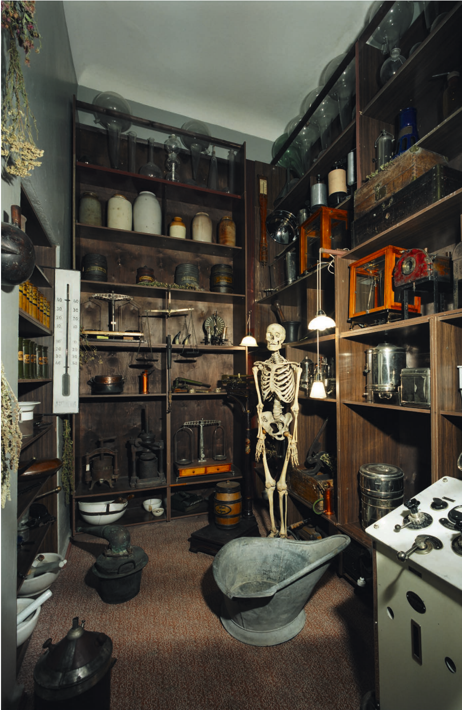
Figure 4. Open storage of the museum. (Pauls Stradiņš Museum of the History of Medicine).