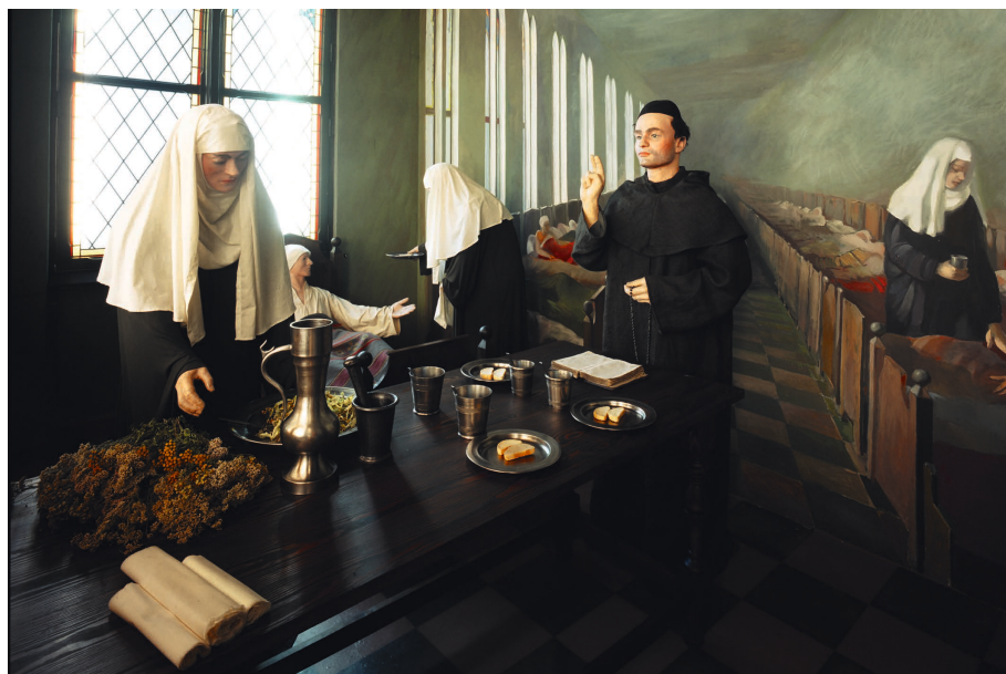
Figure 6. Fragments from the present permanent exhibition: Medieval hospital and town. (Pauls Stradiņš Museum of the History of Medicine).

The story about the history of modern medicine is revealed on examples of various medical topics, for example, the development of surgery after the introduction of anaesthesia, the rules of asepsis and antiseptics, pathology,