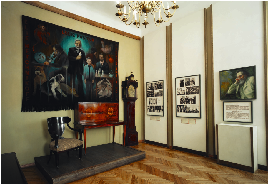
Figure 5. Fragments from the permanent exhibition dedicated to microbiologist Ilya Mechnikov. (Pauls Stradiņš Museum of the History of Medicine).

Maizīte, Ternovsky, Multanovsky, Vigdorčik, Müller-Dietz, etc. The museum has managed to amass a unique collection of old medical texts, many of them in Latin. That is because some of the older libraries in the Soviet Union refused to accept such books, arguing that there was no readership for them.