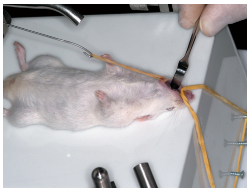
Figure 2. Placing animal on surgery table.

Rodents have been used as models for oral research. These studies include, but are not limited to, periodontal diseases ( Susin and Rosing, 2003 ), mucosal wound healing ( Szpaderska et al., 2003 ), topical delivery drugs therapy ( Erjavec et al., 2006 ), and surgical procedures ( Inal et al., 2006 ). However, access to oral structures remains as a limitation to the use of those animals, especially the mouse. To