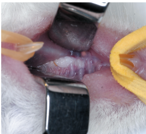
Figure 4. Access to the oral cavity.

achieved even with their small teeth and posterior location of the molars ( Johansen, 1952 ). The new table has been successfully used to perform several oral procedures in mice and rats and, without any modification; it can also be used on hamsters and guinea pigs. The table inclination, the open-mouth elastic device and the buccal retractors provide full accessibility to any oral structures in any size of animal without risk of asphyxia (Fig. 4). The simplification of rodent handling techniques should help facilitate oral investigation ( Moss et al., 1965 ). Our surgical table provides a further contribution to achieve it.