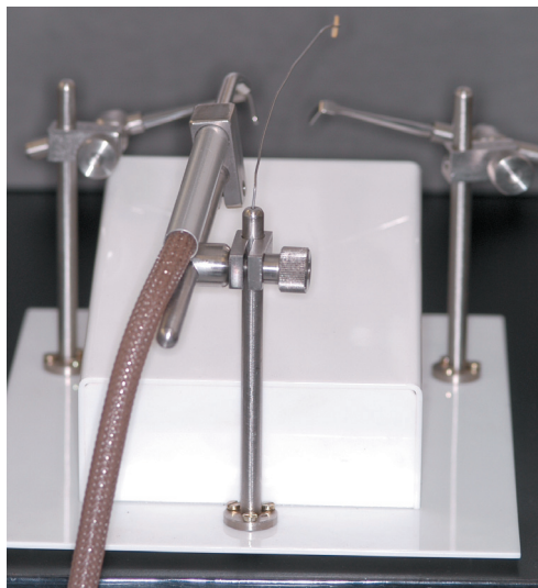
Figure 1. The surgery table with Halogen light source.

To the side of the box and 4 cm from its front, two vertical rods are attached, one at each side, measuring 10 cm. These rods control the positioning of the lateral openers through the use of fixing screws that can be adjusted both in vertical and horizontal direction. It is possible to keep the animal's abdomen in position by means of an elastic band (5 cm in diameter) that is also attached to the lateral rods. Grooves in the lower portion of the rods regulate the tension on the elastic. The placing of the