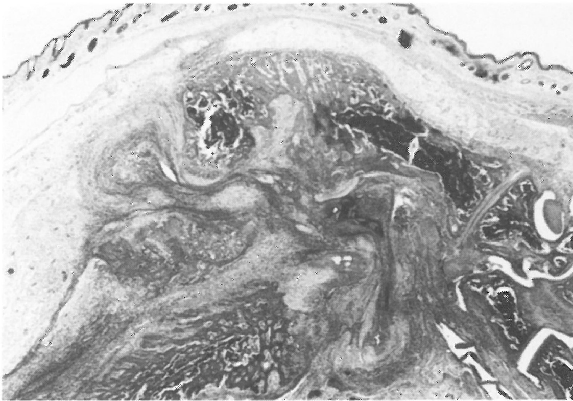
Fig. 2. Hock joint with peri- and intraarticular proliferation of fibrous tissue and purulent infiltration. H.E., \times 14 .