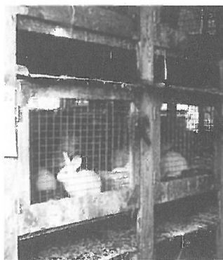
Fig 5 & 6. The breeding of laboratory animals, in Sweden, a decade ago.