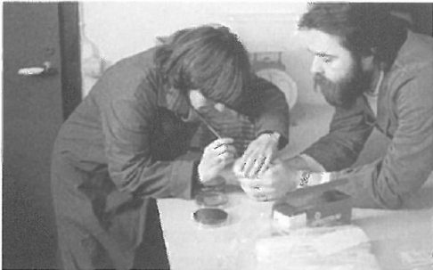
Fig 4. Simple laboratory investigations easy to perform if you have all the equipment needed.

The reasons for the lack of a proper use of laboratory animals are principally: