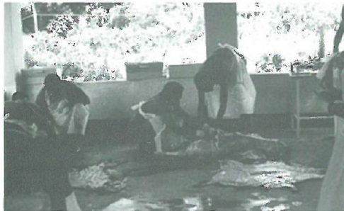
Fig 1. Participants of a training course in pathology and sampling techniques in action.

There usually does not exist any incentive to use defined animals ( Öbrink & Rehbinder 1993). Instead animals used in experiments may be bought on the market or be brought into an experimental research situation taken directly from a garbage dump. (Fig 3). Captured, feral dogs and street dogs may be mixed with domestic dogs in the one and same investigation.