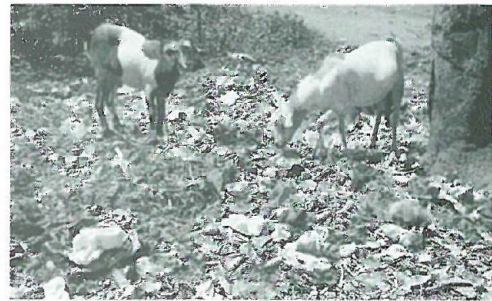
Fig 3. Laboratory animals?

Of the "traditional laboratory animals" mainly rabbits are used and then mostly for the production of antibodies. The use of rodents is usually the exception.