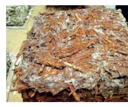
Photo 5. Mould on the test block made of clay and hemp hurd.

270) give an overview of research carried out by Boutini et al., which shows that the production of 1 m^2 of the 260 mm-thick hemp-lime layer uses 370–394 MJ energy and absorbs 14–35 kg of carbon dioxide during its lifetime of 100 years. Production of a similar amount of Portland cement uses 560 MJ of energy and emits 52.3 kg of carbon dioxide. With the development of technology and by adjusting methods according to the test results, we can say that hemp-lime has the potential to reach the level of the thermal insulation standard required for