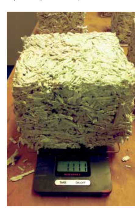
Photo 6. Test block made of air-lime and hemp hurd.