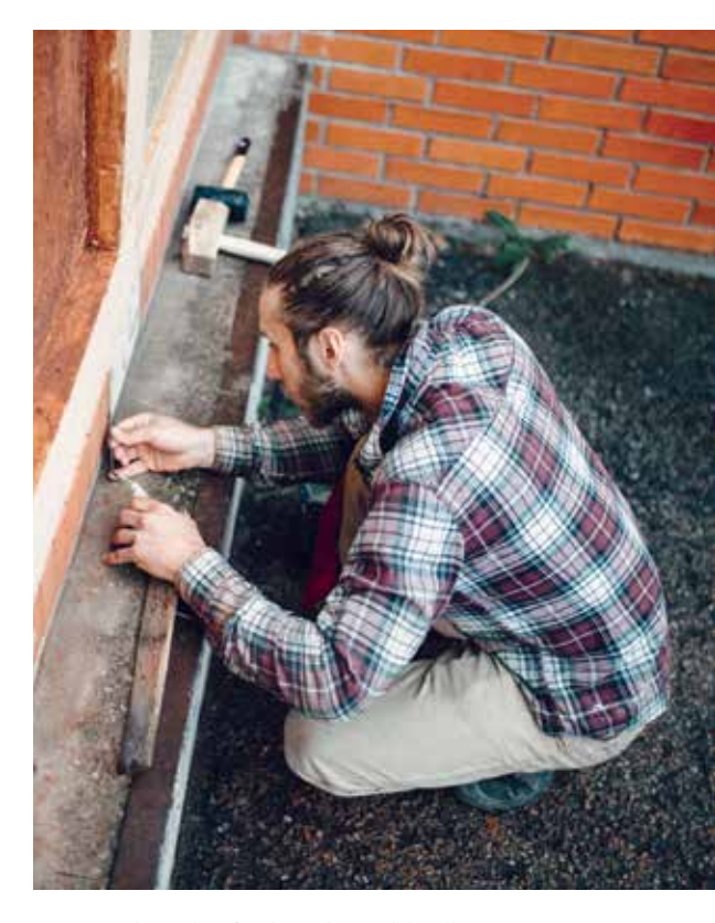
Photo 7. The author finishing the model wall.

Reducing the annual energy consumption of buildings and ensuring the quality of indoor air poses an important challenge to the construction industry. In short, this means the need for more effective use of resources in the production, transport, installation and reprocessing of materials. Processing hemp-lime is relatively nature-friendly, easy and uses less energy in comparison with most modern construction materials. The life cycle of construction materials has so far been a relatively under-researched area, but it is clear that the use of resources needs to be mapped and directed in a much