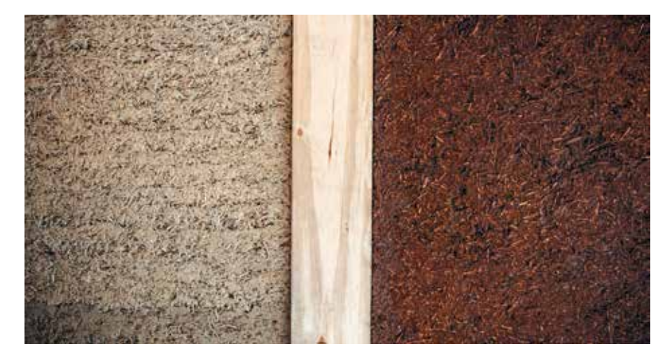
Photo 3. Mixtures of hemp-lime and hemp-clay, separated by an aspen frame.

component in producing hemp-lime, test blocks were also made of natural hydraulic lime and red clay. Sample blocks of 150x150x150 mm were made using these components in different proportions to test for important differences and possible shortcomings. The objective of testing the hemp hurd mixtures with air-lime, clay and hydraulic lime in different proportions was to find the most suitable mixture recipes for each binder. The immediate purpose of testing was to find suitable mixtures for use in a model wall to be built as a practical part of the graduation paper.