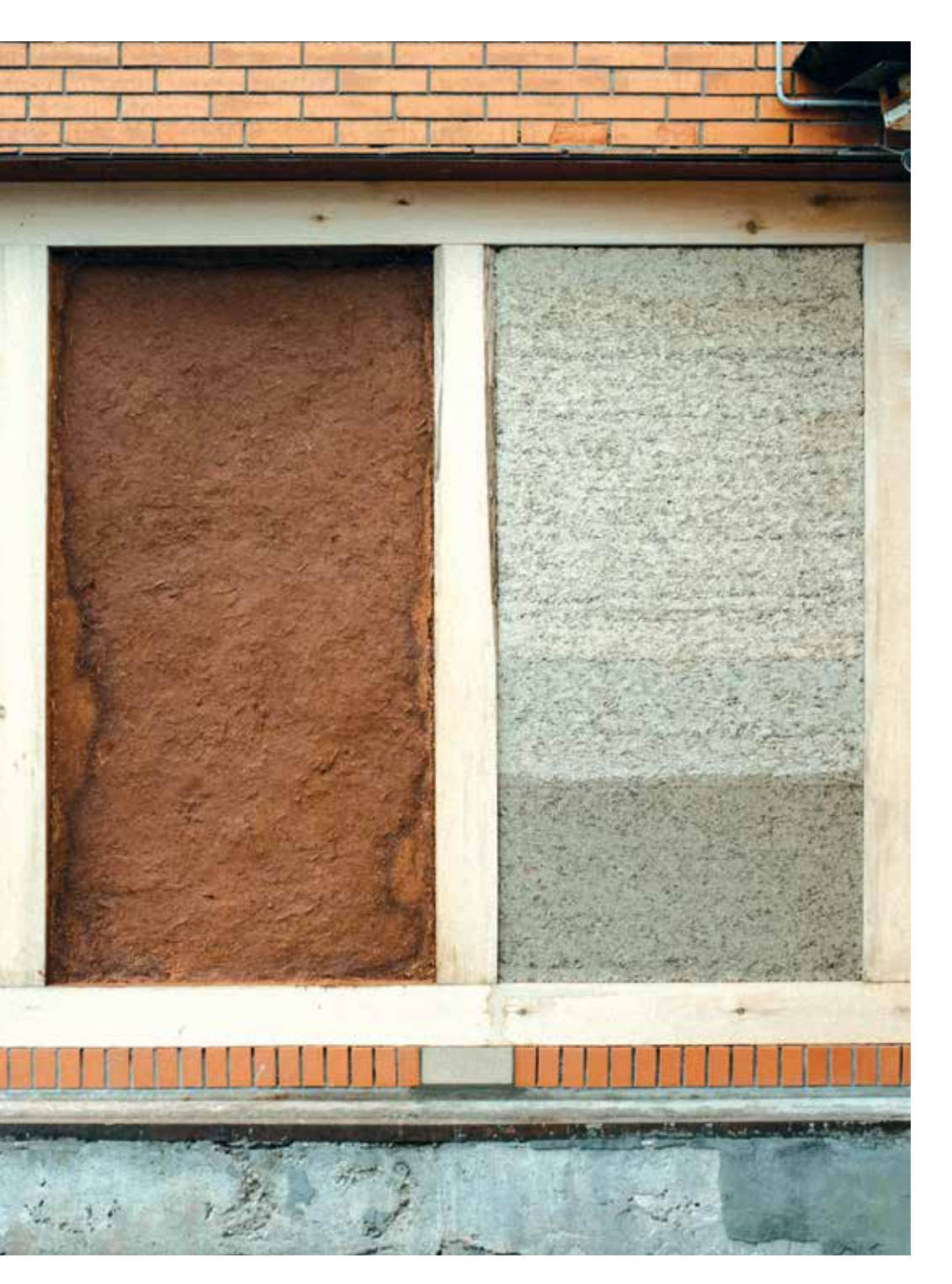
Photo 4. Hemp-clay and hemp-lime model wall.