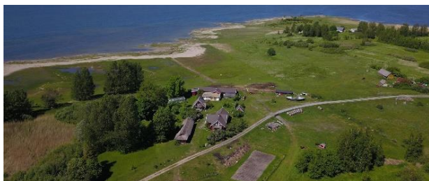
Photo 3: Manija Island. In the center is the Riida tourist farm complex. 74

In addition, the farm has lovely animals on the beach meadow and its own sheep shop. The island of Manija offers true relaxation, the feeling of countryside, the sea, and wonderful sunsets.