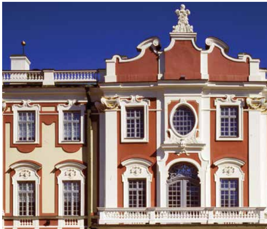
Fig. 11. Kadriorg Palace. Fragment of the facade.

off-centre. 44 It seems probable that Michetti's drawings were detailed and had masterful décor smothered in lacework that, together with water foam on the cascades, highlighted the buon gusto as naturalised in the Baroque architecture – covered by a veil of dreams.