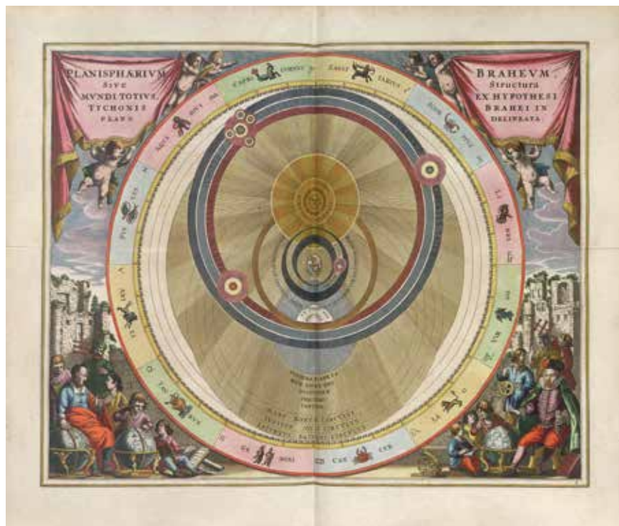
Fig. 3. Tycho Brahe's System of Planetary Orbits, from The Celestial Atlas, or The Harmony of the Universe by Andreas Cellarius

cernibly vast space “in which each molding could become, so to speak, sensitive to the others.” 28