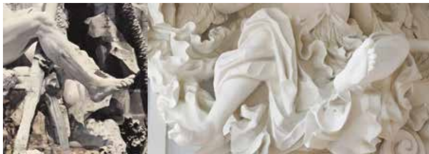
Fig. 5. The feet of Nile by Gianlorenzo Bernini