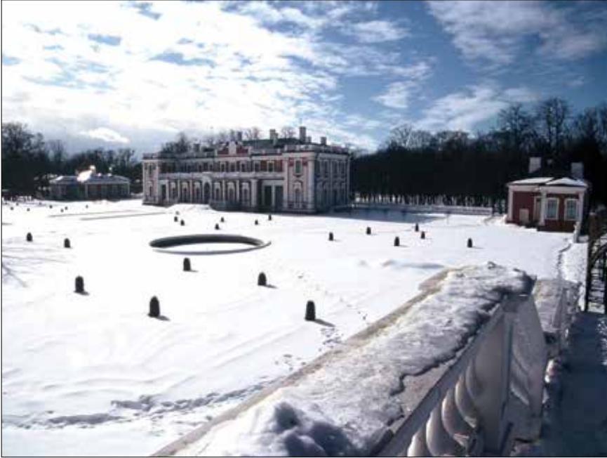
Fig. 4. Kadriorg in snow