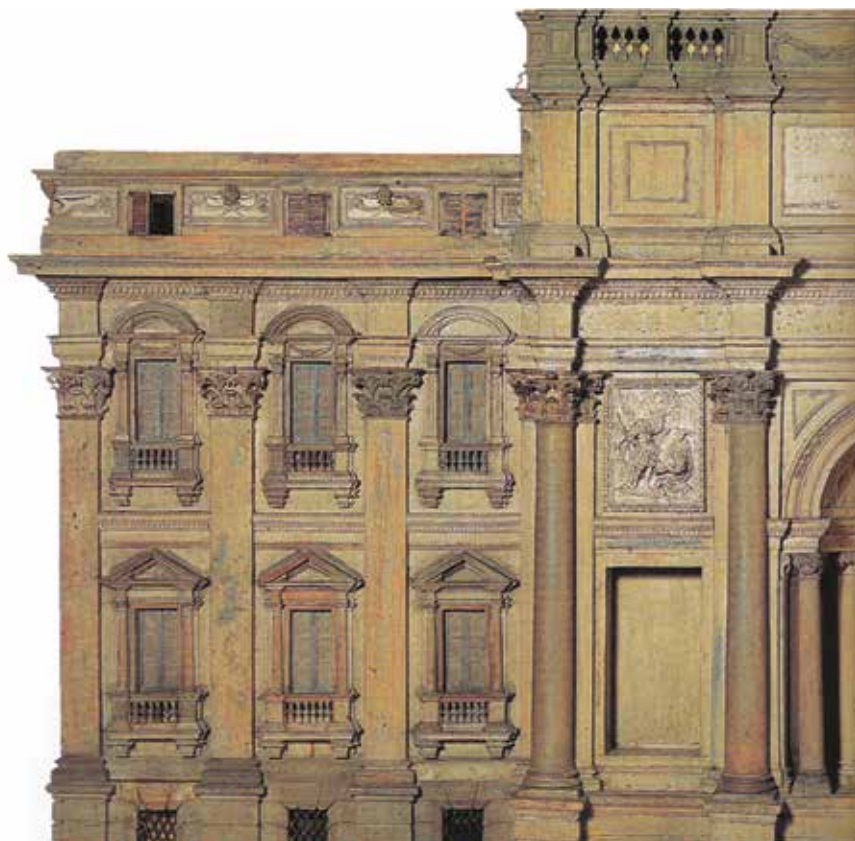
Fig. 7. Niccolò Salvi, wooden model for the Trevi Fountain

thousand years since it was first fixed by the patricians of ancient Rome [...] because it fills a need that never alters, a need which, it is not material but psychological and ideological, is not material to the influences of evolving societies and technologies. The villa accommodates a fantasy which is imperious to reality. 42