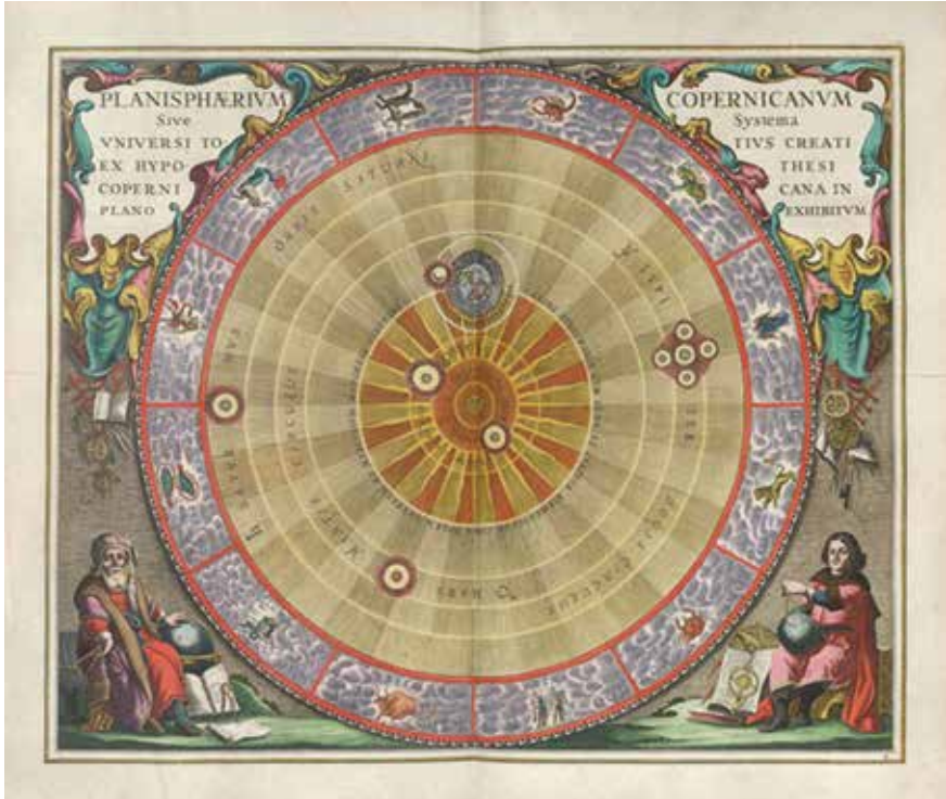
Fig. 2. The Copernican Planisphere, illustrated in 1661 by Andreas Cellarius

del disegno (1797) 24 , and labels Baroque as a period of decline in comparison to the Classic revival of the following period. In the minds of Baroque critics, it continues the traditions of dark ages that already the “antischolastic writers of the sixteenth century found particularly ridiculous.” 25 Contro il barocco (a term used in Italian art historical scholarship) 26 deprives Baroque from its flesh and blood, its “ di far apparire di carne le sue figure ”, 27 taking away all that saw world as a continuous and indis-