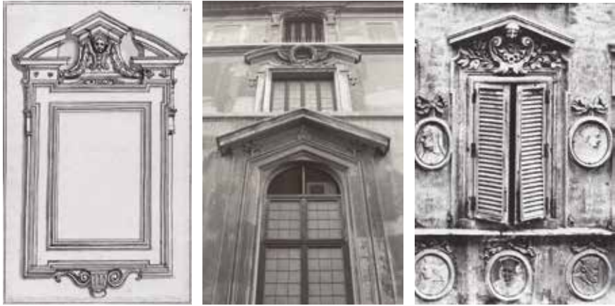
Fig. 8.–10. The windows of Rome. Drawing after Pietro Da Cortona, Collegio di Propaganda Fide – Francesco Borromini, Casa dei ritratti in via del Governo Vecchio by Domenico Gregorini

grove and horse chestnut gardens, hayfields scattered with boulders that extend to the sea. The relation between palaces and nature must be stressed not only in case of Kadriorg but also other residential gardens of Peter I. The association with the nature may be even more than Michetti, himself schooled in Rome, consciously aspired for. Kadriorg reflects the tendencies that shaped the intellectual world in the early eighteenth century and soon led to the dominance of the informal garden style first in England and thereafter in Holland. „Our drift is a noble, princely and universal Elysium, capable of all the amenities that can naturally be introduced into Gardens of Pleasure, and such as may stand in competition with all the designs and stories of this nature, either of ancient or modern times.” 43