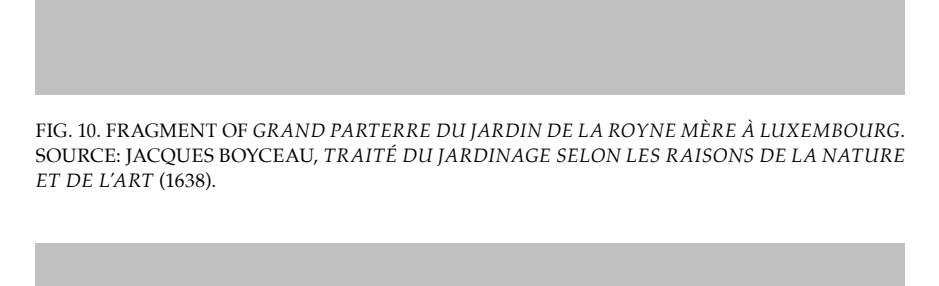
FIG. 11. THE CENTRAL STATUE OF PERSEUS IS SURROUNDED BY FOUR DOLPHINS WITH WATER ERUPTING FROM THEIR MOUTHS. SOURCE: PIERRE DAN, LES TRESOR DES MERVEILLES DE LA MAISON ROYALE DE FONTAINBLEAU (1642).