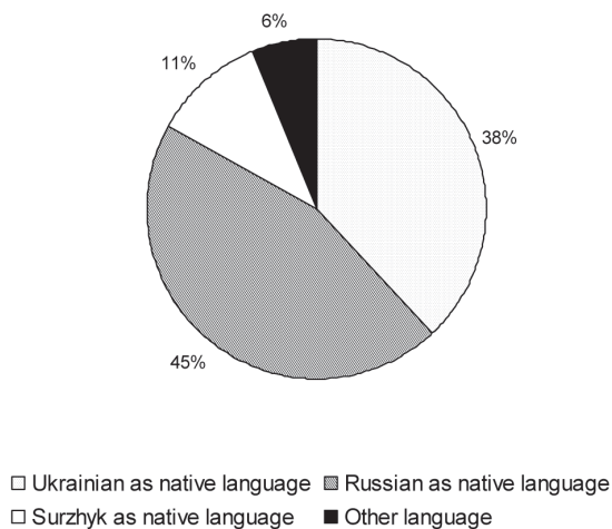
Figure 3. The distribution of the adult population of Ukraine according to their native language in 2003 (N = 22.462).

According to this model there are not only three linguistic groups in Ukraine (whose native language is Ukrainian, whose native language is Russian, whose native language is a minority language) as 2001 national census shows us, but we must deal with an additional group: people whose native language is surzhyk. If we look at the linguistic picture based on the sociological survey, we may say that peoples who speak Russian as their native language comprise the relative majority in comparison to peoples with Ukrainian as their native language (see Fig. 3).