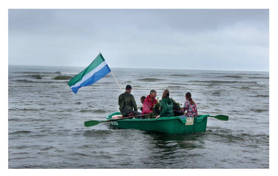
Figure 3. The offering of an oak leaf wreath to the Sea Mother is one of the activities during the Livonian Festival, photo by I. Vītola (August 8, 2021).

"Līvu sasaukšanās / Livonian convocation"; it was a joint production by the choir "Anima", conductor Laura Leontjeva, and composer Uģis Prauliņš. The programme premiered in 2019, marking the UNESCO Year of Indigenous Languages (Anima 2019).