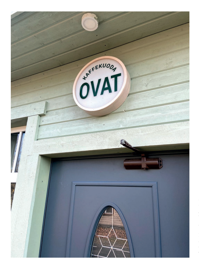
Figure 5. The Livonian-language sign at a local coffee shop in Ikla (October 29, 2021).