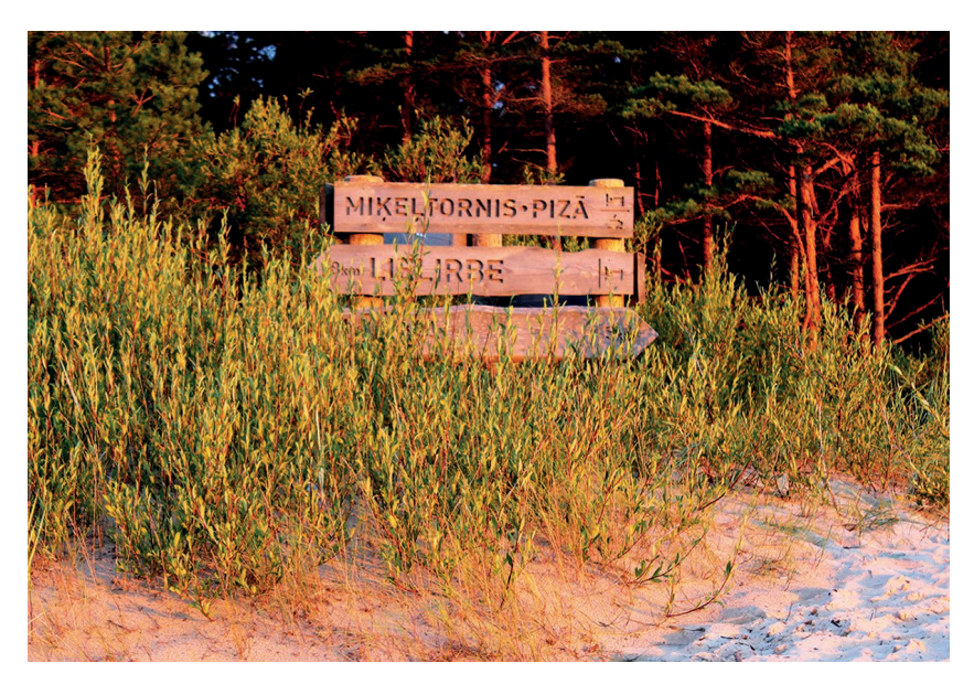
Figure 2. A sign with the name of the village of Pizā or Miķeļtornis on the beach, photo by I. Vītola, (August 6, 2021).

Research into the linguistic landscape shows that Livonian-language signage and place names are mostly seen on the Livonian Coast, for instance, on a granite slab near the Livonian Community House in Mazirbe and in inscriptions of grave monuments in village cemeteries. There are also signs with the names of the Livonian villages on the beach; information stands and village signs in Mazirbe, Košrags, Saunags, Vaide; the permanent exhibition "Kolka. One island. Two seas. Three Languages" at the Kolka Livonian Community House; etc. (Figure 2).