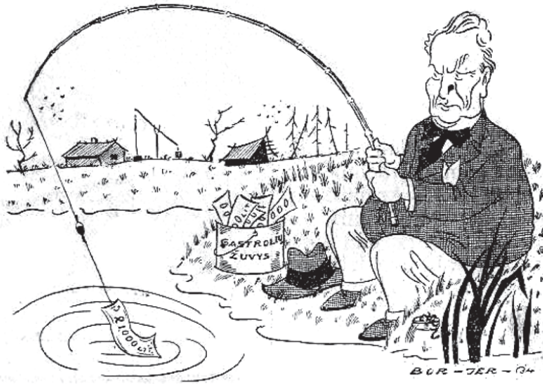
Plate 3. “Pleasant Recreation.” Famous singer Shaliapin intends to come to Lithuania to fish. ( Kuntaplis 1934, No. 27.)