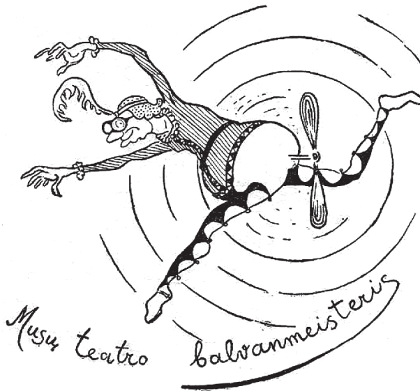
Plate 4. "Balletmaster of Our Theatre." ( Spaktyva 1927, No. 11–12.)