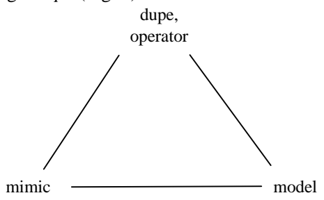
Fig. 1. Every mimicry system includes three components: model, mimic and dupe. If one of these participants is missing, the whole system will lose its idea.

created a new concept of mimicry to explain similarity of warning colorations among insects (Müller 1878). In the last decade of the nineteenth century E. Poulton published several papers about mimicry in the context of natural selection theory (Poulton 1890, 1898). Contributions by H. Cott and F. Heikertinger should also be mentioned as highly significant (Cott 1940; Heikentinger 1954). In 1967, Wickler created a new concept of mimicry systems using terminology of information theory (Wickler 1967). From that point forward mimicry has been seen as ecological set-up that includes two or more protagonists, performing three roles: being a model , being a mimic , and being a dupe (Fig. 1).