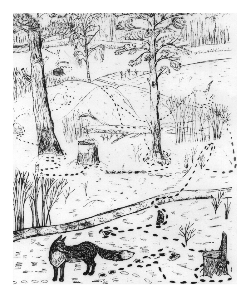
Figure 1. These footprints belong to a red fox ( Vulpes vulpes L.). The tracks go in the direction of the spectator, beginning from the upper left-hand corner of the picture. The fox is orientated by the following objects: reed mace, the tracks of corvine auks (not indicated in the picture because of their remoteness), a small cavity in the ice, a box, the channel bank, an anthill, a stook, the same anthill again, etc. (see Table 1.). The total of objects perceived by the individual — 34; the number of classes of objects — 27; the number of discrete motor responses — 98. The length of the track path — 670 m.