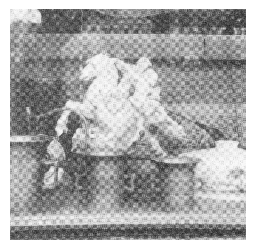
Figure 2. The porcelaine horse in the Terezin shop window reflecting the photographer, which emphasizes the strategy's self-referentiality (Sebald 2001a: 197).

The function of these photographs is, I would suggest, diagrammatic since they have a structuring effect in the narrative. They also call for reading as 'imaginization' — involving not only visual, but also aural, olfactory and tactile effects — and 'allegorization'. Because not only do these black and white photographs dialogue with the text, or rather, disrupt the dialogue with the text, creating their own eerie voices counterpointing and sometimes contradicting that of the narrator. Instead of creating a logical order, they appear, scattered across the