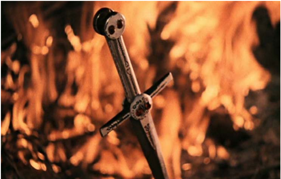
Figure 3. The dagger as a sign of freedom; the ambivalence of the song.