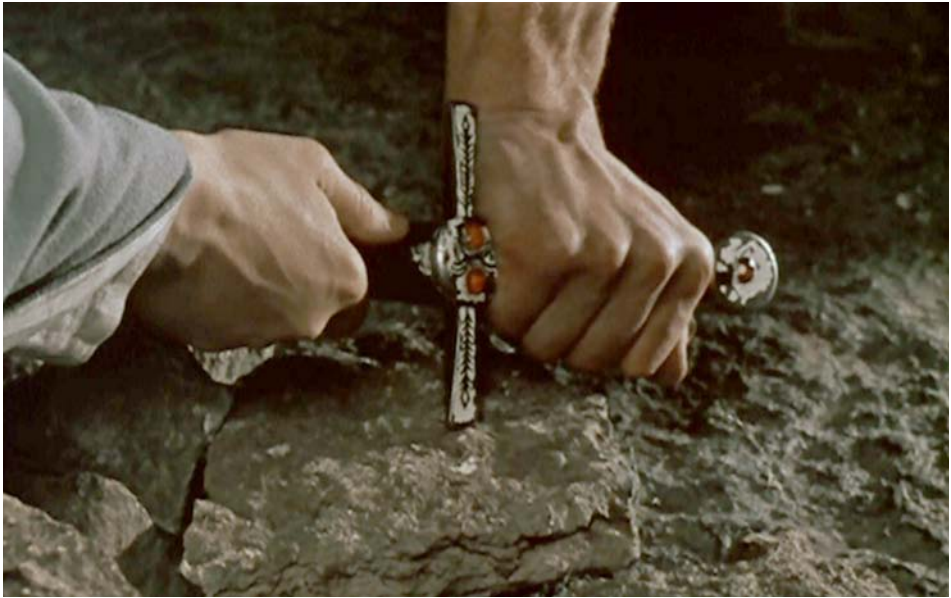
Figure 10. The dagger as a helper.