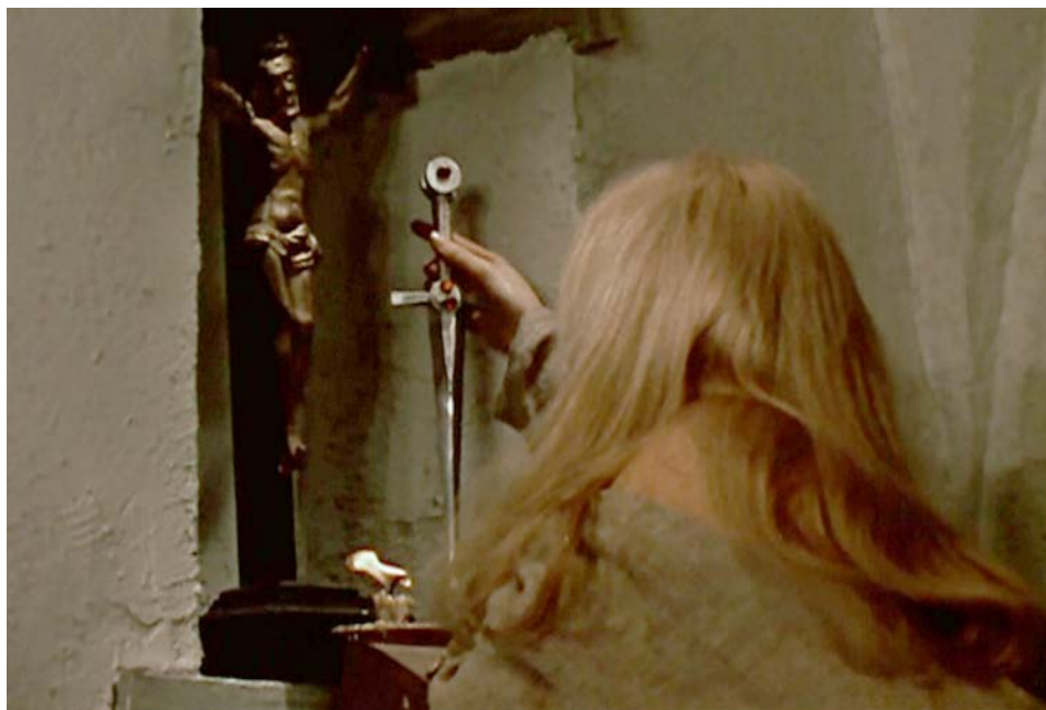
Figure 9. While imprisoned in the abbey, Agnes tries to kill herself with the dagger.