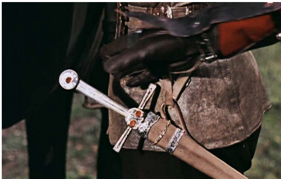
Figure 5. Gabriel's step-brother Ivo takes the dagger from him.