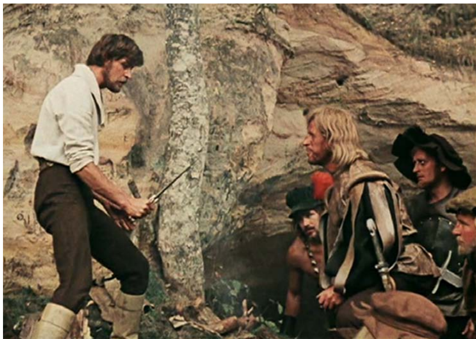
Figure 4. Dagger and self-defence.