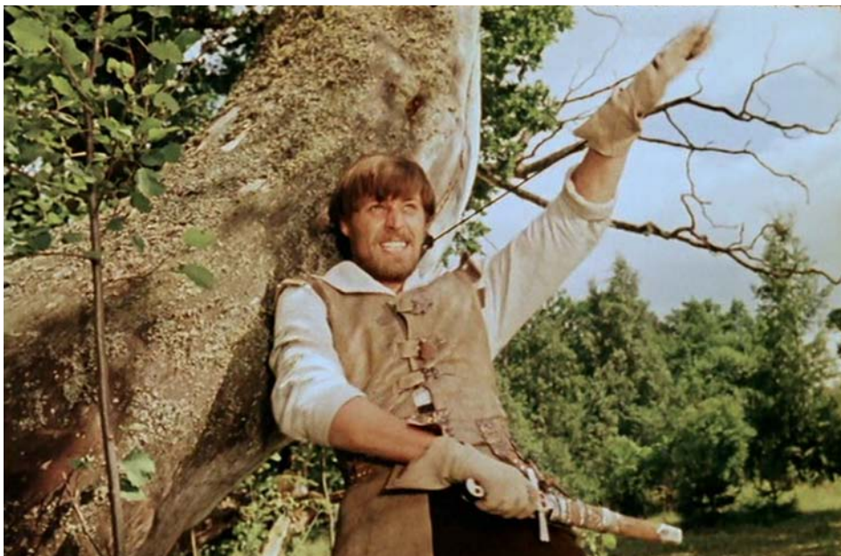
Figure 1. The dagger is to help one to become free.

The repetition of the dagger as an ambivalent symbol is emphasized in the film (see Figures 1–12):