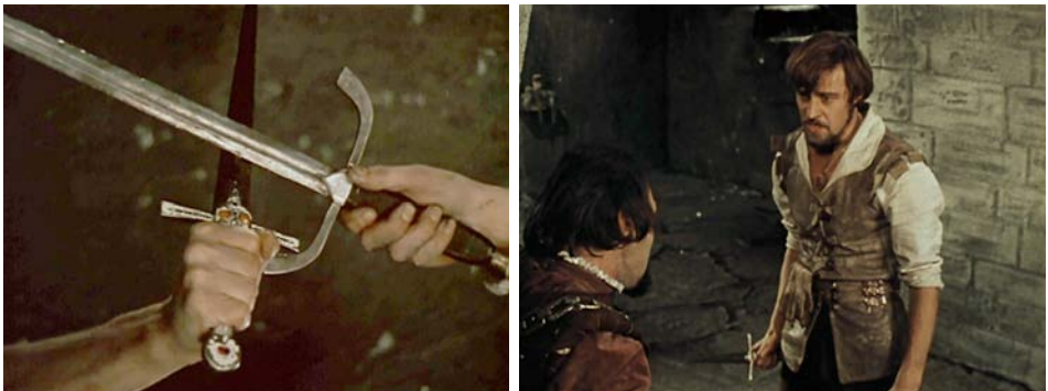
Figures 11–12. Gabriel kills his step-brother with the dagger (saying the words: “I am not a free man”).

The necessity of fighting for freedom and the hopelessness of changing anything by doing so is replayed heterophonically. What remains is either death or escape.