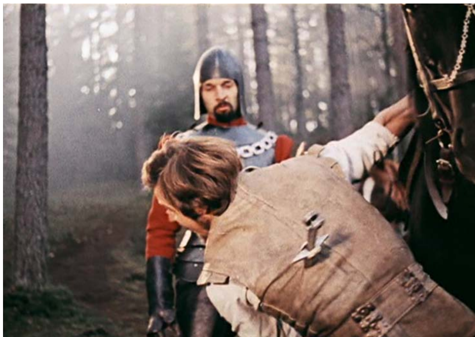
Figure 6. Gabriel's step-brother kills him with Gabriel's own dagger.