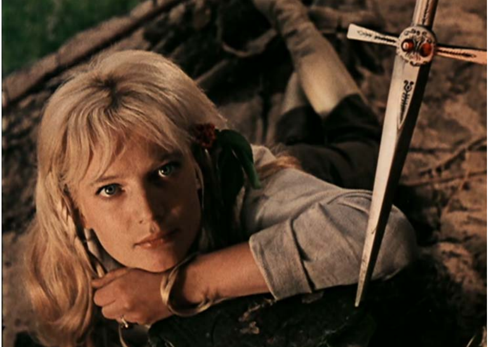
Figure 2. The dagger as a musical theme (a melody without lyrics).