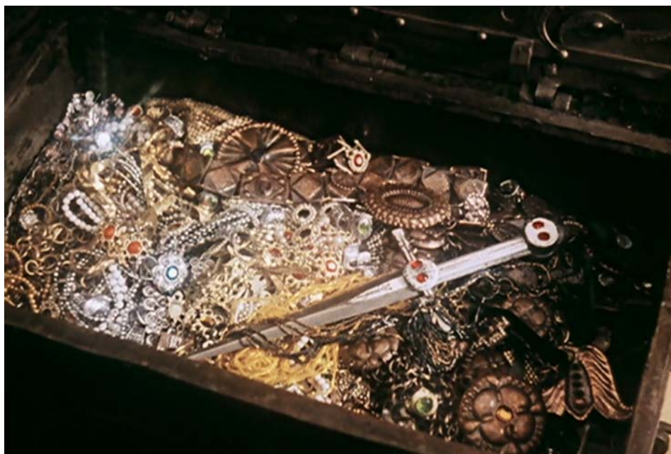
Figure 7. The main female character Agnes notices the dagger in a jewel casket.