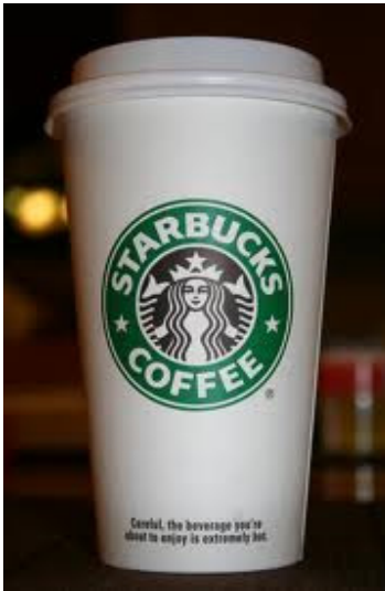
Figure 3. An example of association of contiguity.

what we see with what we already know; we use our collateral experience to interpret the logo. If we recognize the logo as the Starbucks logo, we have made an association of resemblance. Whether we feel attracted to it or not depends on our prior knowledge about this particular brand. Some may have negative emotions in connection with it, since it is an American brand in the same associational set as fast-food chains like McDonald's, Burger King and Kentucky Fried Chicken. This is not a coincidence since the décor of Starbucks in many ways resembles other fast-food chains.