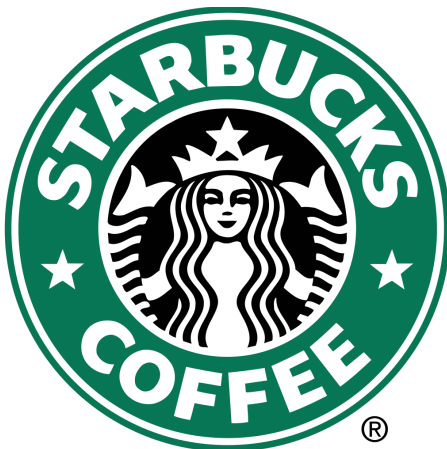
Figure 2. Starbucks logo.

Let us try to look at some examples of association when interpreting brands. For instance, we can see the Starbucks logo (Figure 2):