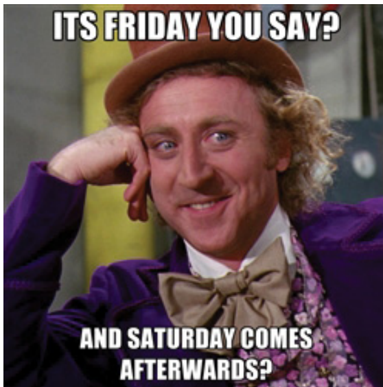
Figure 5b. The lyrics to Rebecca Black's Friday are cited in these image macros belonging to the Advice Animal and Condescending Wonka internet memes respectively.