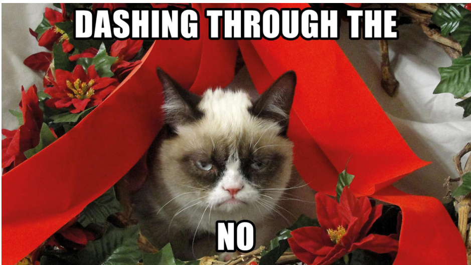
Figure 2. Modified version of 'Grumpy Cat' with added text.