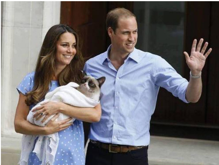
Figure 3b. 'Grumpy Cat' contextualized within other famous images as the 'Monna Lisa' and the 'Royal Baby', both recognized as depicting notable grim smiles.