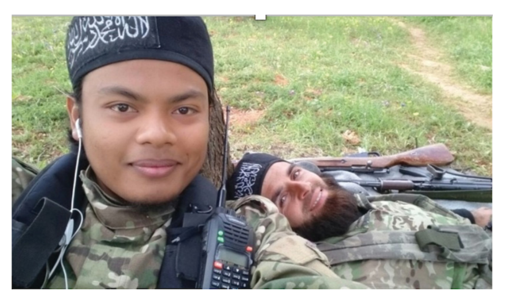
Figure 1. Noncombative Selfie.

Curiously, while Western mainstream media tends to focus on the darker side of Islamic extremists, according to Klausen (2015) violent images from the battlefield constitute a tiny fraction of content that attains viral popularity within jihadi online communities. Arguably, the reason for the non-violent selfie's popularity over its violent counterpart is that it shows an alternative version of jihad which challenges age-old stereotypes of the Arab world as alien, barbaric and hostile. Instead non-violent selfies portray a far gentler and more humanistic portrayal of the religious warrior (see Fig. 1). For example, Ingram, Whiteside, and Winter (2020) and Winter (2018) note that digital self-portraits of jihadist soldiers petting cute kittens (dogs are not haram), posing with jars of Nutella, making pizza, playing videogames, luxuriating poolside or going fishing attract far more popularity than battlefield combat portraits.