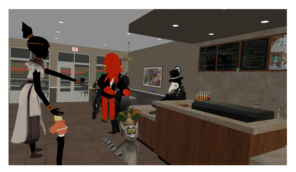
Figure 2. Interior of a virtual coffeeshop in VRChat.

Is it remembering the scent of roasted coffee beans as soon as you walk in? Is it the reminiscing on the taste of your favourite drink that you usually order? Or is imagination drawn towards remembering the sounds and sights within your experience of being in coffeeshops? Regardless of what was specifically imagined, the mental images perceived are objects for the things that emerge within the subjective experience and conceptualization of a coffeeshop.